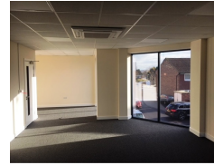
2nd office/conference room